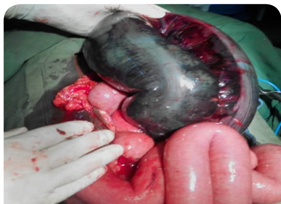
Figure 5. One of our patients with coffee-bean necrosis of the sigmoid colon.

erations skills had been honed. This mortality rate is in contradistinction to the results of one-stage emergency resection and primary anastomosis for sigmoid volvulus by Naseer et al. [15] and Sule et al. [16] in their one-stage procedure in the management of acute sigmoid volvulus without colonic lavage. The smallness of our patients' population for this type of surgery would have mitigated our results. A prospective study of a larger patients' subset would help better the learning curve eventually.