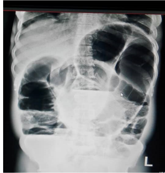
Figure 1. Plain X-ray of abdomen; bird's beak and coffee bean signs.

Twisted mesenteric knots were identified in all patients; twenty-three patients had frank necrotic segments with varied sizes and numbers of perforations and peritoneal spillage of stool. Severe abdominal spillage of stool from perforations of necrosis of the twisted colon segment negatively affected morbidity and mortality values [1, 6] . The procedure involved removing the enlarged necrotic colon segments after first clamping about 2-3 cm into its healthy proximal colon