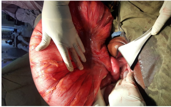
Figure 4. Acute volvulus without necrosis; a knot of narrow elongated mesenterial base in anticlockwise rotation.