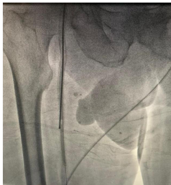
Figure 1. Atherectomy device is seen successfully passed from the occluded area.