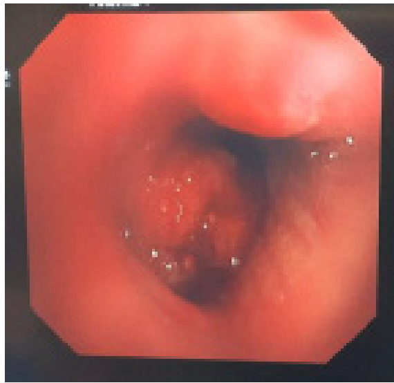
Figure 1. CT-Chest (mediastinal window) of the patient with respiratory papilloma showing an endo-luminal mass located at the left main bronchus and encroaching on the left upper lobe bronchus

revealed a multiple mixed glandular and squamous cell papilloma. Although the pathologist considered the differential diagnosis of inflammatory polyps, he favored the diagnosis of multifocal papillomatosis due to the presence of squamous epithelial hyperplasia and glandular epithelium. The surgical resection or ablation was the treatment of choice to restore the patency of the airway and to eradicate the disease. Two options of surgical interventions were proposed. The first option was the thermal ablation of the mass lesion via combined rigid and fibre-optic bronchoscopy. The second option was to perform a sleeve left upper lobectomy. Following discussion with the patient, the first option was favored by the patient and the treating medical team. The second surgical option was postponed if the first one was unsuccessful or incomplete.