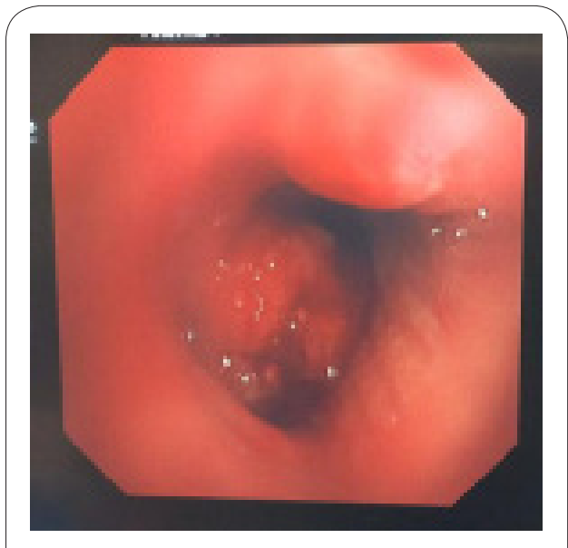
Figure 1. CT-Chest (mediastinal window) of the patient with respiratory papilloma showing a endo-luminal mass located at the left main bronchus and encroaching on the left upper lobe bronchus

revealed a multiple mixed glandular and squamous cell papilloma. Although the pathologist considered the differential diagnosis of inflammatory polyps, he favored the diagnosis of multifocal papillomatosis due to the presence of squamous epithelial hyperplasia and glandular epithelium. The surgical resection or ablation was the treatment of choice to restore the patency of the airway and to eradicate the disease. Two options of surgical interventions were proposed. The first option was the thermal ablation of the mass lesion via combined rigid and fibre-optic bronchoscopy. The second option was to perform a sleeve left upper lobectomy. Following discussion with the patient, the first option was favored by the patient and the treating medical team. The second surgical option was postponed if the first one was unsuccessful or incomplete.