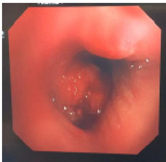
Figure 1. CT-Chest (mediastinal window) of the patient with respiratory papilloma showing a endo-luminal mass located at the left main bronchus and encroaching on the left upper lobe bronchus

revealed a multiple mixed glandular and squamous cell papilloma. Although the pathologist considered the differential diagnosis of inflammatory polyps, he favored the diagnosis of multifocal papillomatosis due to the presence of squamous epithelial hyperplasia and glandular epithelium. The surgical resection or ablation was the treatment of choice to restore the patency of the airway and to eradicate the disease. Two options of surgical interventions were proposed. The first option was the thermal ablation of the mass lesion via combined rigid and fibre-optic bronchoscopy. The second option was to perform a sleeve left upper lobectomy. Following discussion with the patient, the first option was favored by the patient and the treating medical team. The second surgical option was postponed if the first one was unsuccessful or incomplete.