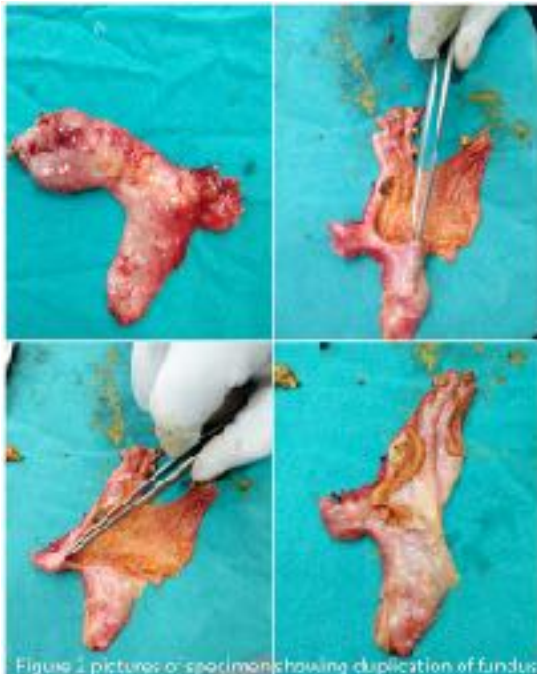
Figure 2 pictures of specimen showing duplication of fundus