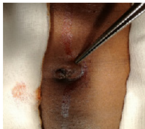
Figure 1. An umbilical nodule of hard consistency, with nipple surface, ulcerated in places and not painful.

at the body and tail of the pancreas measuring 59 x 48 x 44 cm with fuzzy limits and little enhancement after injection with heterogeneous necrotic appearance (Figure 2). This invades the splenic vein. Hypodense epiploic masses of 26 mm per pancreatic in contact with the gastric wall and 11.4 mm peri-umbilical suggest nodules of carcinomatosis. The patient had many biopsies of this umbilical lesion. Anatomopathological examination with an immunohistochemical study concluded with cutaneous metastasis of pancreatic adenocarcinoma. The diagnosis of a tumour of the body and the tail of the pancreas with umbilical and peritoneal metastases was