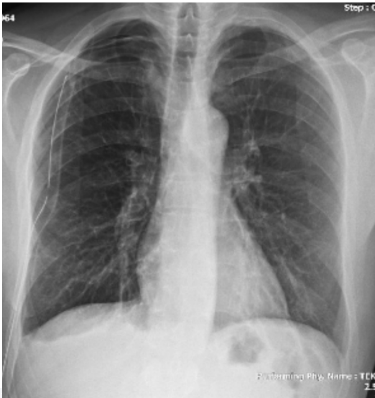
Figure 2. Right lung expansion defect seen on PA chest x-ray at fourth post-procedure day.

tomography, and thoracic ultrasonography may help the physician in diagnosing IPx [7].