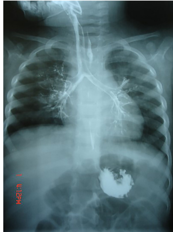
Figure 2. A contrast study of the esophagus showing a trachea-esophageal fistula after caustic ingestion.

the possibility of future stricture formation, the risk of iatrogenic esophageal perforation is high. It is better to be done 6 weeks after the corrosive ingestion to minimize the risk of esophageal perforation. Endoscopic evaluation of the esophagus will confirm the contrast study findings and assess if the stricture is passable or not. It also has the advantage of being therapeutic at the same time (Figure. 3) [5, 6].