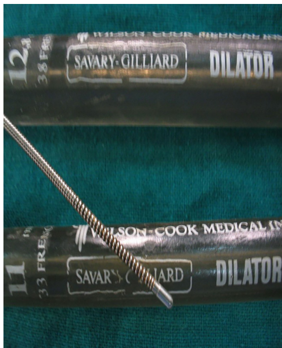
Figure 5. Savary-Gilliard esophageal dilators.

ically guided EBD in children ranged from 64% to 100% [14].