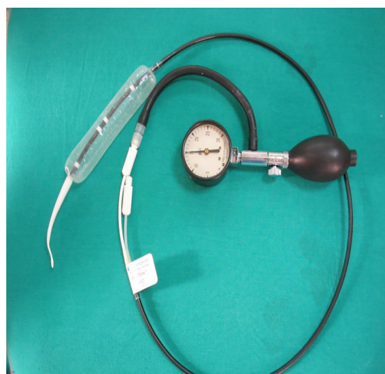
Figure 6. Balloon esophageal dilators.