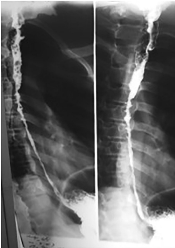
Figure 1. A contrast study of the esophagus showing a long caustic esophageal stricture.

After the lapse of at least 3-4 weeks, dye study should be done carefully using water soluble non-irritant dye for the fear of aspiration and subsequent pneumonitis due to spill over or the presence of fistula. The study should be done under screen and the dye is given orally or injected slowly through a naso-esophageal tube with suction device ready beside the patient. It will provide a basic image before doing an intervention. The study will demonstrate the site, the number, the length and the diameter of the stricture and will show associated gastro esophageal reflux or pull up of the stomach by esophageal fibrosis causing hiatus hernia. Once the diagnosis of stricture is evident, the patient is scheduled for upper endoscopy after the lapse of at least 6 weeks from the initial injury. The data obtained from the contrast study should be correlated with that found on endoscopy [3, 4]. Some studies recommended doing endoscopy in the first 12-48 hours after the ingestion. Although it has the advantage of assessing the degree of affection and hence