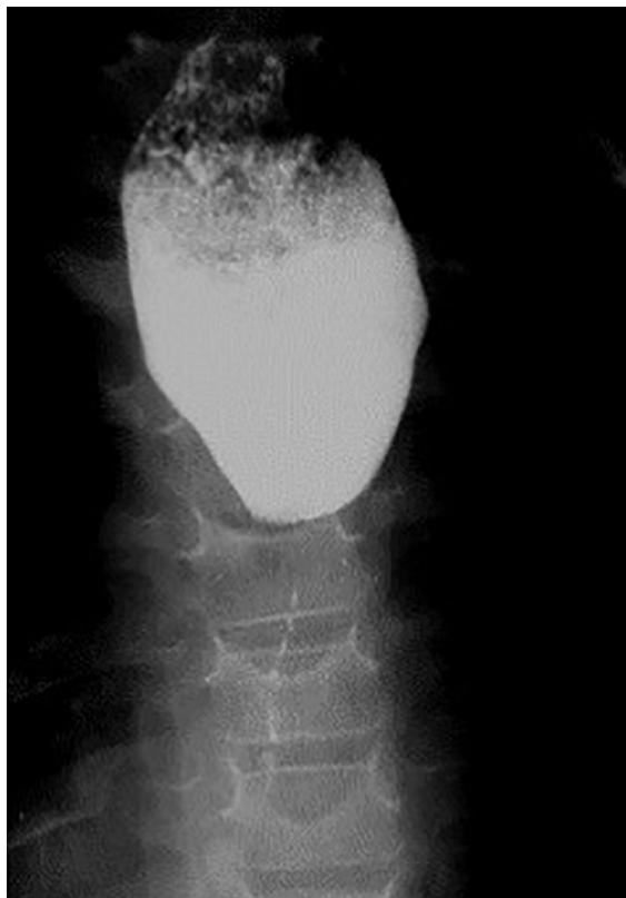
Figure 3. A contrast study of the esophagus showing severe caustic stricture.

Practically, barium swallow is done at 2-4 weeks after caustic ingestion and dilatation starts at 6 weeks after ingestion. Barium swallow will provide crucial information on the stricture which could determine the safety and success of endoscopic dilatation. Esophageal dilatation can be done using various types of dilators. It can