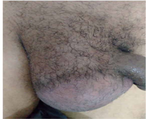
Figure 1. A scrotal swelling which is painful and transluminal.

The diagnosis can be confirmed by culture, Ziehl-Neelsen staining, and/or histological examination [8] . The cytological study allowed the diagnosis to be made