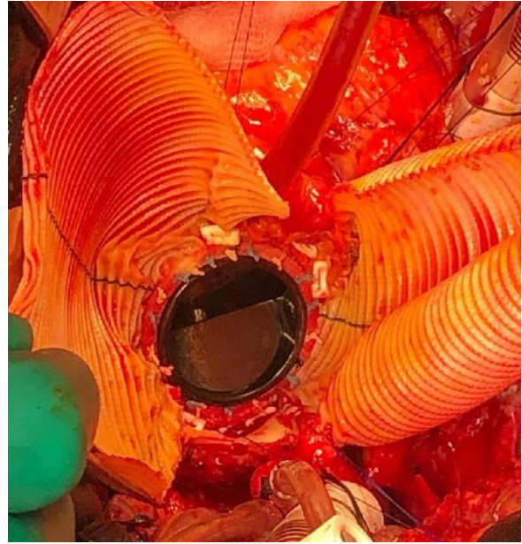
Figure 2: No: 27 St. Jude mechanical valve was placed with the help of Teflon reinforced 2/0 ti-cron sutures.

performed to relieve mild pulmonary stenosis. RVOT was reconstructed using a dacron patch (Figure 3). Weaning of the cardiopulmonary bypass was achieved with milrinone (0.75 mcg/kg/min) and adrenalin (0.05 mcg/kg/min) infusion. The operation was ended conventionally. The patient was taken to the intensive care unit. The cardiopulmonary bypass and cross-clamp times were 138 minutes and 106 minutes, respectively. The patient was extubated in the 6th hour. The intensive care unit stay was 56 hours. Postoperative course was uneventful and the patient was discharged from the hospital after 8 days.