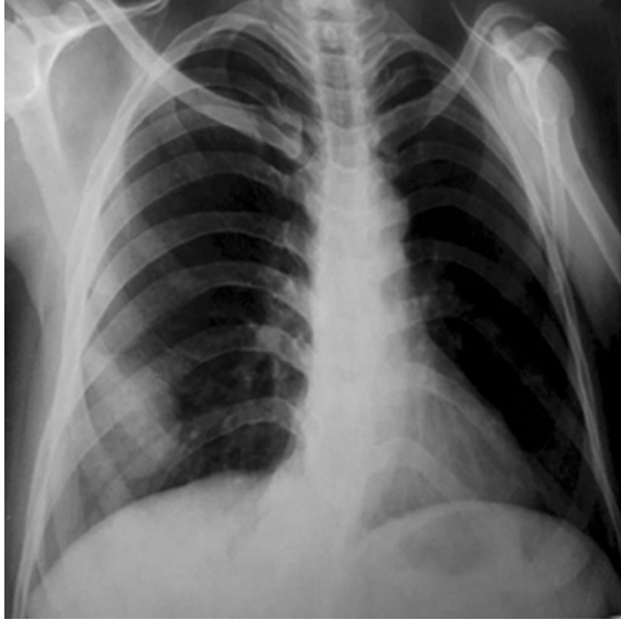
Figure 1. Postero-anterior view of chest X-ray shows an opaque shadow in the lower zone of the right hemi-thorax.