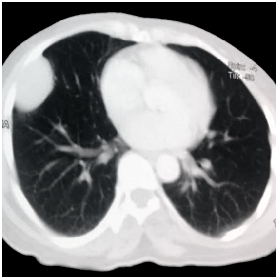
Figure 2. Axial view of chest CT scan shows a right pleural-based mass.

course was uneventful, with freedom from symptoms and tumor recurrence within two years of follow-up after surgery.