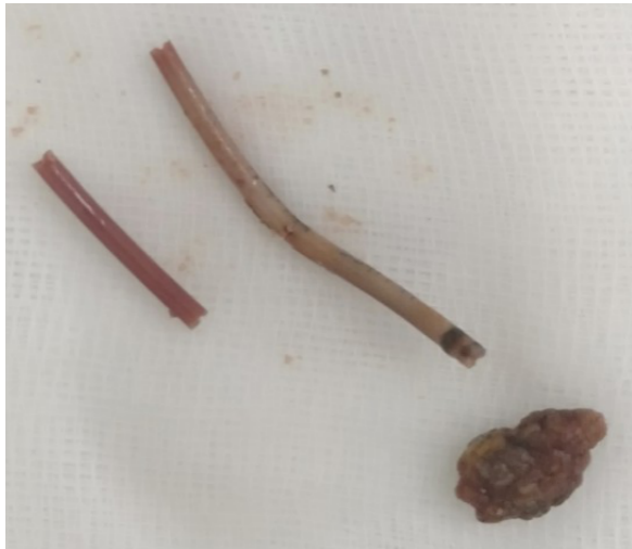
Figure 1. Fragments of double J ureteral catheter and calculus expelled during urination.