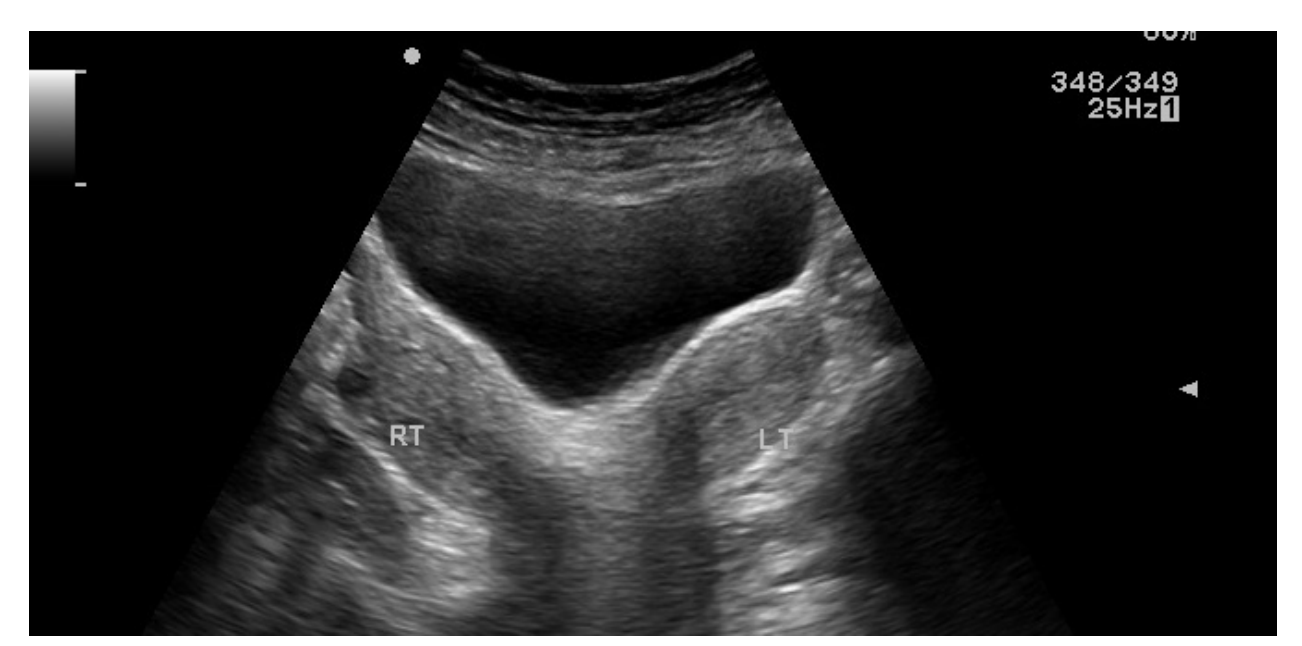
Figure 1: USG images two separate uterine horns, additional findings noted on USG were absent left kidney and collection in pelvis & RIF.

After initial resuscitation (IV fluids and antibiotics), the patient was taken for emergency surgery. Under general anesthesia after painting & draping, a classical vertical midline incision was made, wound developed in layers. Approximately 500 cc pus contaminated fluid was drained. Complete small & large bowel loops were examined, they were found dilated due to adhesions; adhesiolysis was done. Left fallopian tube was found dilated & filled with pus, left ovary was found partially sloughed out. The sloughed ovarian tissue was sent for HP examination. Peritoneal lavage was done with peritoneal drain placed in pelvic cavity. Wound was closed back in layers.Early postoperative period was uncomplicated. There was significant decrease in the WBC counts. On post operative day 5, patient was afebrile; clinicalcondition was satisfactory with normal WBC counts on discharge. She was advised to attend gynecology OPD for further definitive management. Biopsy report confirmed the presence acute inflammatory infiltrate with no granuloma.