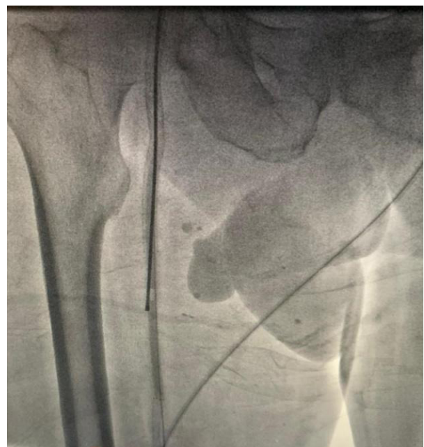
Figure 1. Atherectomy device is seen successfully passed from the occluded area.