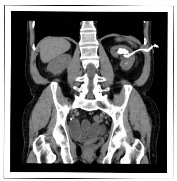
Figure 1. CT coronal plane. Upper calyx lithiasis.

On the day of the surgery, in the Galdakao-modified Valdivia position, we performed an antegrade pyelography through the left nephrostomy tube showing the hydronephrotic changes, the lithiasis, and filling of the rectal ampulla (Figure 4). Because of the location and magnitude of lithiasis, the lower calyx was chosen to puncture using