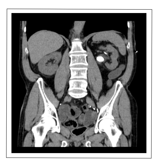
Figure 3. CT coronal plane. Renal pelvis lithiasis.