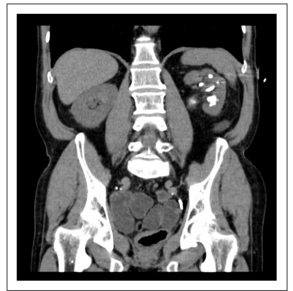
Figure 2. CT coronal plane. Lower calyx lithiasis.