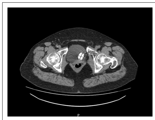
Figure 2. CTU showed an increase in both the intravesical and extravesical components and calcification.

Her first check flexible cystoscopy revealed a calcified deposit in the region of her previous resection area with progression in size. She underwent further transurethral resection, which again reported benign leiomyoma on histology. She continued on conservative follow-up, with 6-monthly imaging with CTU and magnetic resonance imaging (MRI) demonstrating stable appearance of her bladder leiomyoma for almost 14 months. Despite this, she experienced increasing urinary storage symptoms and hematuria. Subsequent CTU showed an increase in both the intravesical and extravesical components and calcifications (Figure 2). In view of her increasingly bothersome symptoms and radiological progression, she was counseled regarding surgical excision. It was felt that continued conservative management risked further increase in size with resultant surgery being more complex with a higher risk of functional complications. The patient agreed to undergo robotic-assisted transvesical bladder leiomyoma excision.