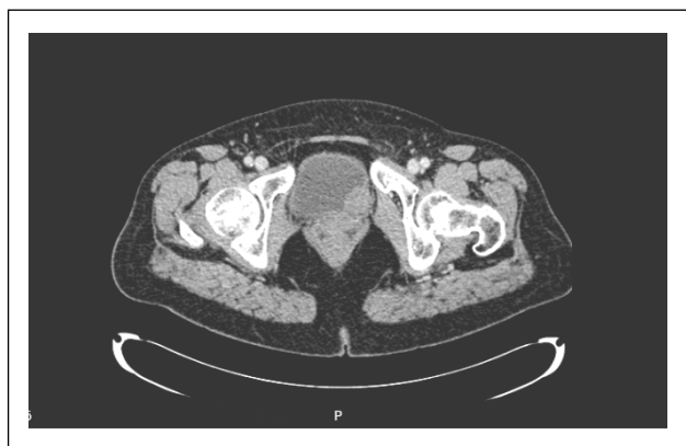
Figure 1. CTU showed the soft tissue density mass within the left posterior wall of the bladder extending toward the bladder neck.

She subsequently proceeded to rigid cystoscopy with transurethral resection biopsies and ureteroscopic LASER fragmentation of the right ureteric stones. Cystoscopy re-