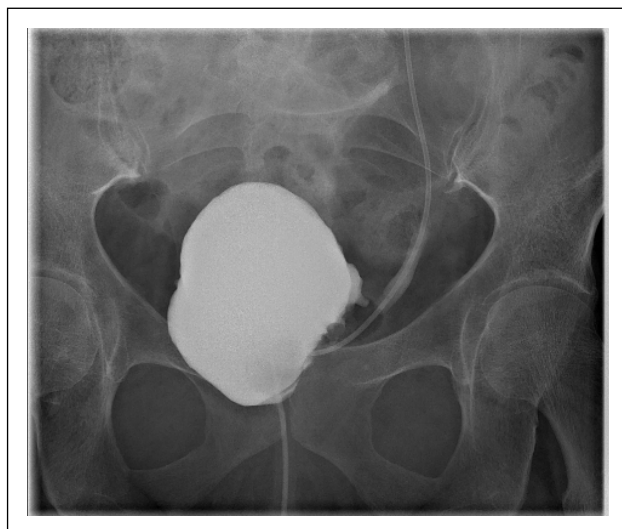
Figure 4. Cystogram prior catheter removal confirming no leakage.

fully continent with no ongoing lower urinary tract symptoms, and was discharged from follow-up.