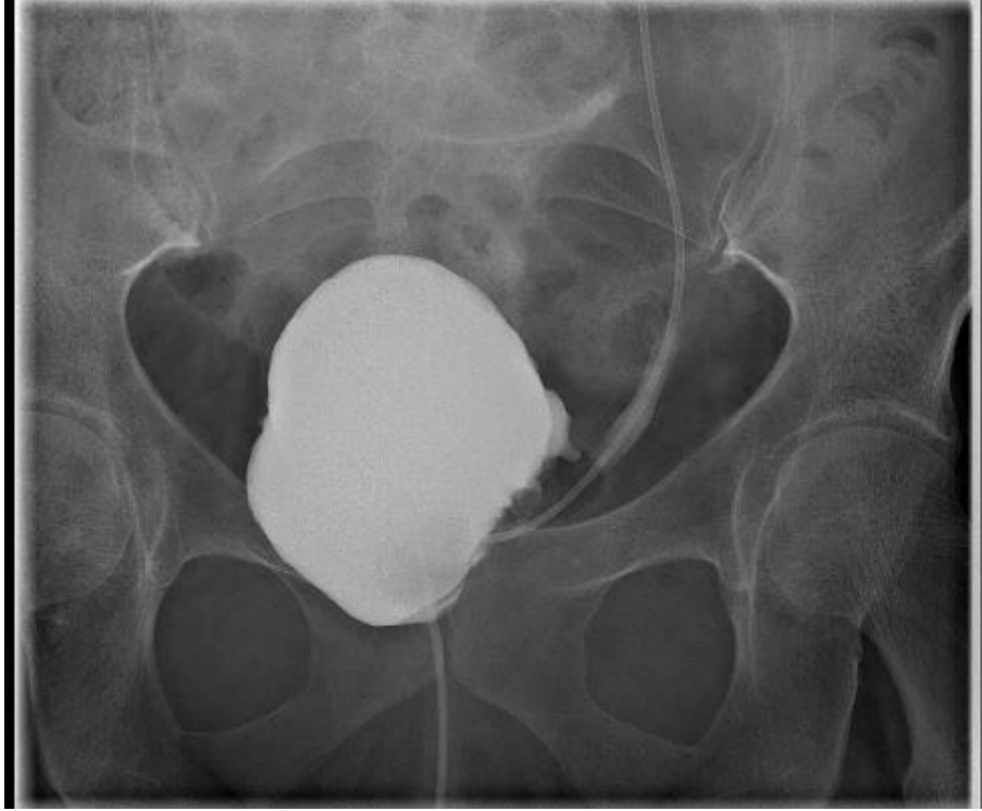
Figure (4): Cystogram prior catheter removal confirming no leakage