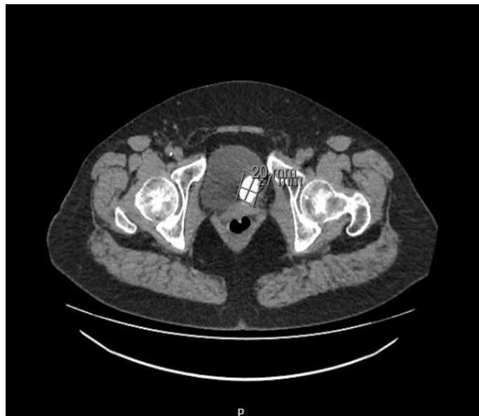
Figure (2): CTU showed an increase in both the intravesical and extravesical components and calcification.