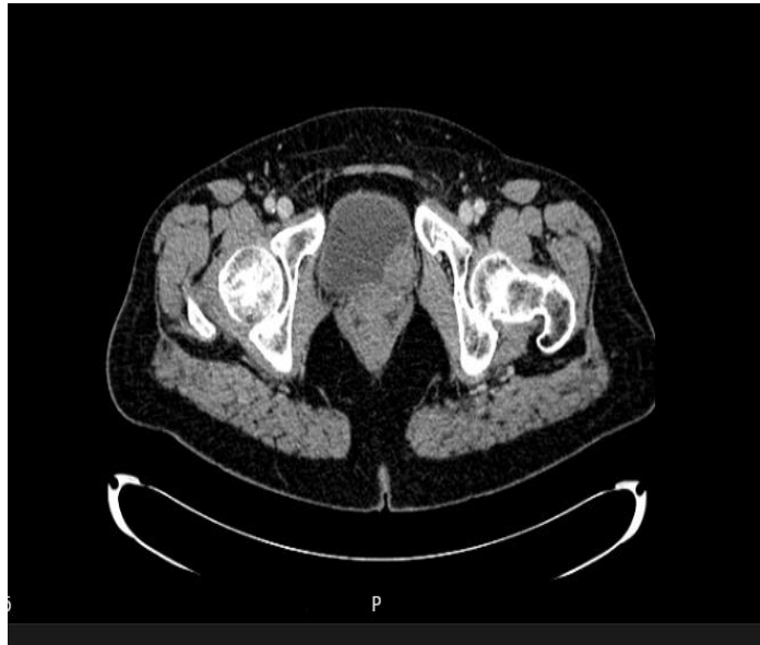
Figure (1) CTU showed the soft tissue density mass within the left posterior wall of the urinary bladder extending towards the bladder neck.